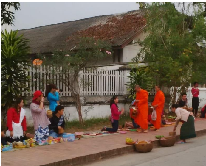
Early morning alms round in Luang Prabang, Laos, February 2015

This option runs on Tuesdays in Hilary Term 10.00am-12.00 noon [time subject to change] venue: Institute of Social and Cultural Anthropology , 51-53 Banbury Road.