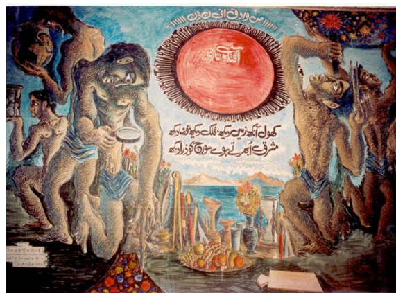
Syed Sadequain Ahmed Naqvi. Aftaab-e-Taaza, an illustration of poetry by Iqbal

in civil war in 1971. The poorer Eastern Pakistan (now Bangladesh) was labelled a 'basket case' in the mid-1970s and is now lauded as a human development success story. The richer Western Pakistan (now simply Pakistan) was widely heralded as one of the world's miracle economies in the 1960s, but is now more commonly seen as an economic failure. Pakistan has long been seen to be subordinate to the US, will the recent turn to China and the China-Pakistan Economic Corridor change that or lead to a new form of dependence?