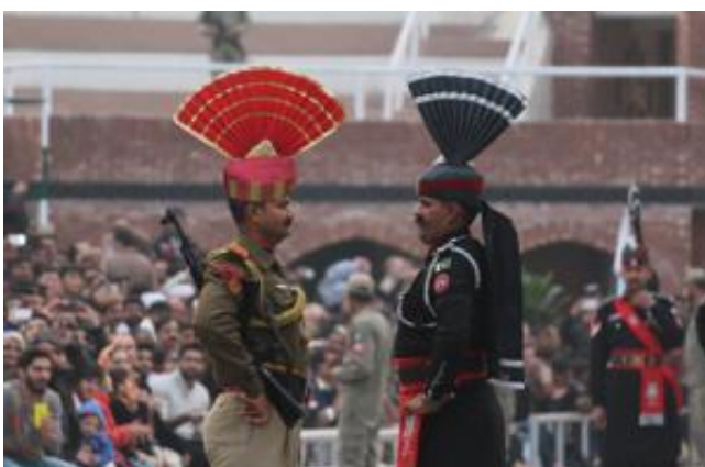
The beating retreat ceremony at Wagah Border of India-Pakistan.

venue: TBC (possibly at St Antony's College)