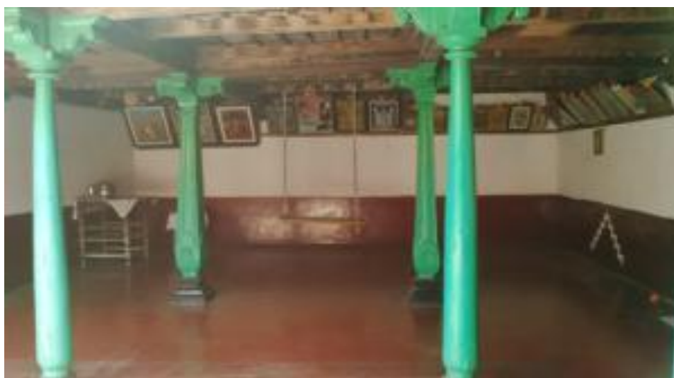
A reception room in the headman's house in the village of 'Rampur', near Mysore, Karnataka, made famous by M.N. Srinivas's book, The Remembered Village .

religion, personhood, ethnicity, and political and social change in the South Asian context, including an appreciation of their contemporary relevance. The course includes engagement with