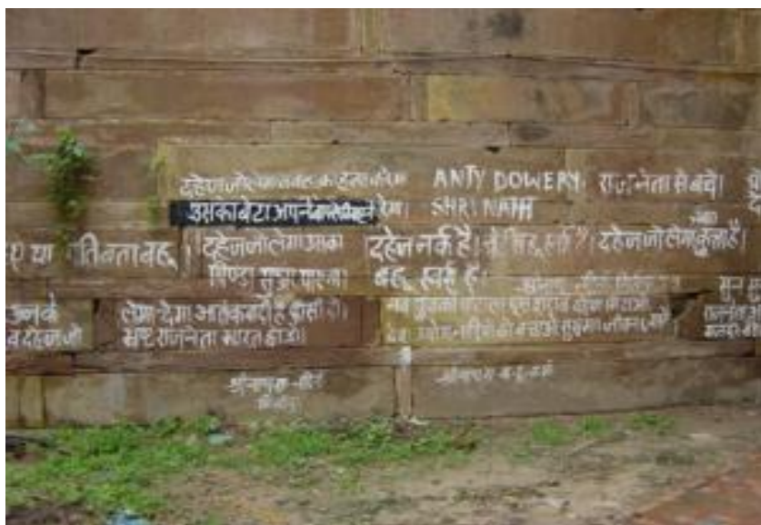
The image above shows graffiti protesting against dowry, Allahabad Fort, c. 2003.