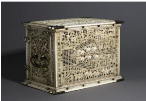
Ivory cabinet, 1600s, Sri Lanka

an interdisciplinary and cross-cultural subject that illuminates our shared society and identity, similarities as well as differences.