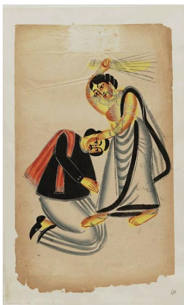
A painting from the late C19th Bengal Kalighat school, 'Woman striking man with broom'. It reflects contemporary fears about changing power relationships in the household.

What do we mean when we use the word 'gender' in the context of history writing? We often use statements such as 'rewriting history' through the gender lens – what does this imply? Is it simply studying women's history? This course will answer such questions by examining socio-economic and political relations in India from the 1800s to the present, using gender relations as a tool for historical analysis – thereby exploring power dynamics and the (re)structuring of both colonial and post-colonial society in India and providing a nuanced understanding of historically specific politics. Gender has been central to India's experience of colonialism. From the conflicts over widow remarriage and the age of consent to interconnections with caste, labour and nationalism, the status of Indian women attracted the gaze of missionaries, colonial legislators and metropolitan liberals. For Indian conservatives, reformers and later nationalists, women and the family became powerful symbols, conveying a complex mix of different class, community and national identities.