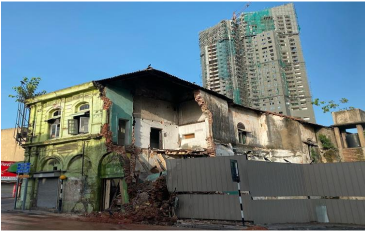
Development at work, Colombo, Sri Lanka

South Asia today is not only geopolitically significant but has risen to global prominence as an important locale for burgeoning economic growth and development, cultural production and nation building. Since the early 1990s, the region has experienced unprecedented levels of economic growth and rapid social change. Its rapidly growing economies diverge across and within Bangladesh, India, Pakistan and Sri Lanka thereby paving