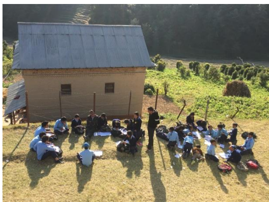
A school in Nepal

venue: Ground Floor Seminar Room, OSGA 11 Bevington Road