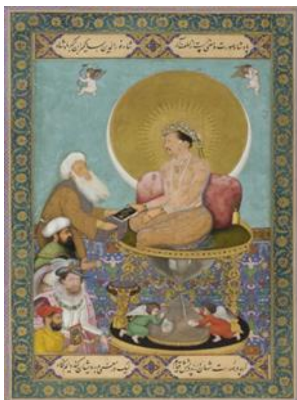
The emperor Jahangir preferring a Sufi Shaikh to Kings, c. 1615-18

Venue: Lecture Room 1, Oriental Institute, Pusey Lane