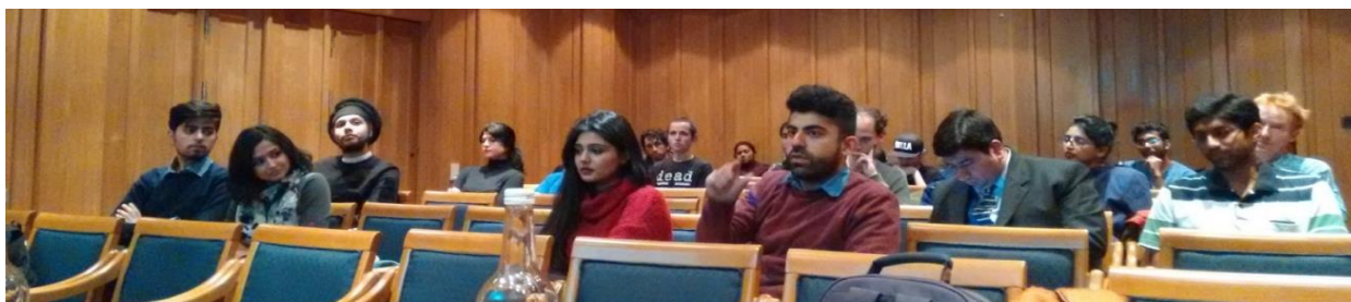
Seminar on Demonetisation November 2016