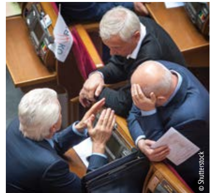
Negotiations in the Ukrainian Parliament

'We found that minority presidents have certain tools they use to elicit support from other parties,' says Tim. 'We identified five: their own legislative power (for example, the power of veto or decrees they can issue alone); budgetary power (controlling spending); cabinet powers (satisfying other parties by giving them cabinet appointments); partisan powers (authority within their own party); and informal